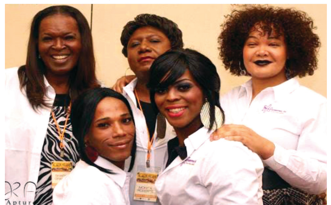
2016 Grantee Black Transwomen Inc, Dallas, TX

As a facilitator, I have watched many groups struggle in moments like these over the years. I could easily imagine the process failing had the group not had multiple people of color who could work together to find the best answers to the dilemma at hand. In groups where there is a greater degree of tokenism, the sole representative is often either deferred to - with the others usually acting out of guilt – or disregarded and shut down. Neither outcome has true integrity. Instead, what I saw in this case was how better representation created room for complexity in the conversation. I saw high engagement, a willingness to listen to each other and step back if needed, to offer challenges, to voice vulnerability and frustration, and to slowly find a way forward so that a decision could be made in a way that respected the many insights being offered and the inherent value of the applicants themselves. With all of us at the table, we had what we needed to give our best to the process and to each other.